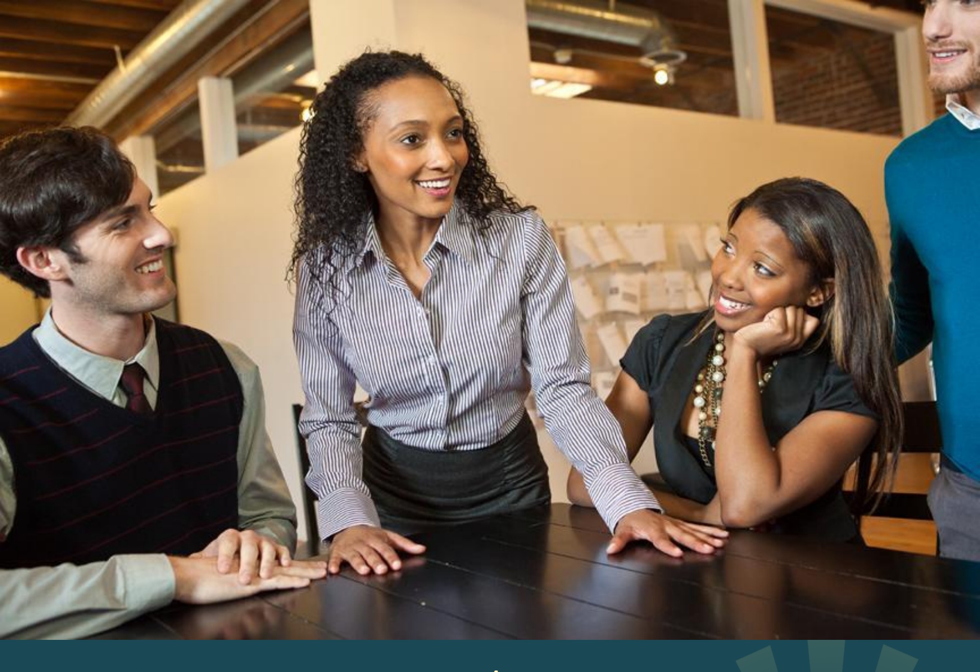
Identify your team – Area/Division Directors